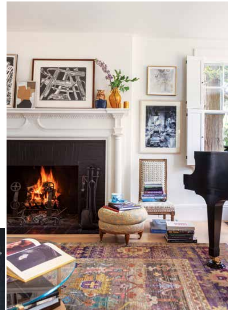
ABOVE: The off-lit living room fireplace, the largest of four throughout the house, takes the chill off during winter months; an art deco French ottoman discovered in Paris sits in front of a Louis XVI chair from Axel Vervoordt, both of which are covered in Fortuny fabrics. LEFT: A nook in the entryway houses an eighteenth-century Italian cabinet from David Neligan Antiques in Essex, Massachusetts, and a floor lamp from Venetia Studium in Venice. FACING PAGE: Epure black burlap wallcovering by Élitis in the foyer and on the three-story stair hall makes for a dramatic entrance.