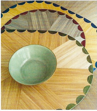
TERRY PLACEMATS Straw marquetry, lisondecaunes.com