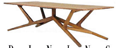
LIBERTY TABLE Designed by Atelier Van Lieshout, moooi.com