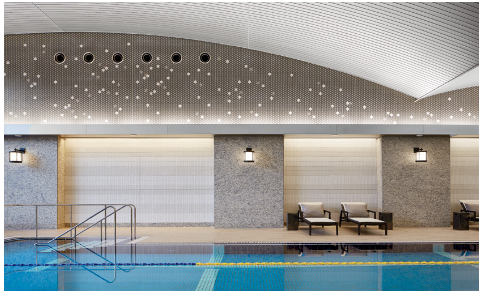
Opposite top: An aluminum-clad ceiling channels condensation away from the swimming pool's roof. Opposite bottom: From 34 stories up, the main dining room offers panoramic views.