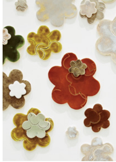
Top, from left: Ceramic flowers scatter over a corridor's wall. The installation is a collaboration with Moss & Lam. Bottom, from left: Granite pathways cross the courtyard. Chairs in the workshop are by Charles and Ray Eames.