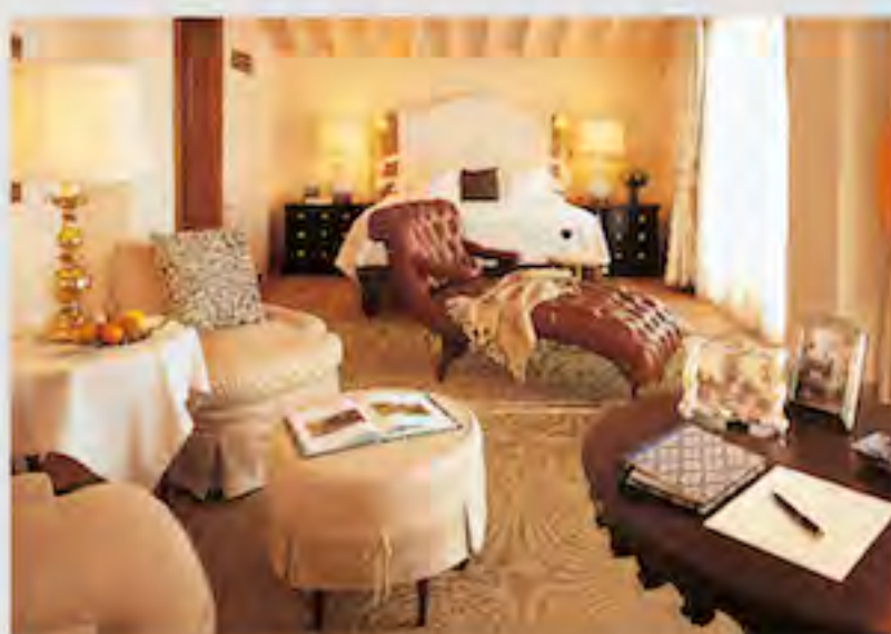
Grand Hotel a Villa Feltrinelli, Italy

This new, three-level private residence on Hong Kong's Peak is timeless and elegant. BAMO was responsible for the complete design of interior architecture and furnishings of the home, encompassing lavish rooms for entertaining as well as private spaces for the family to enjoy.