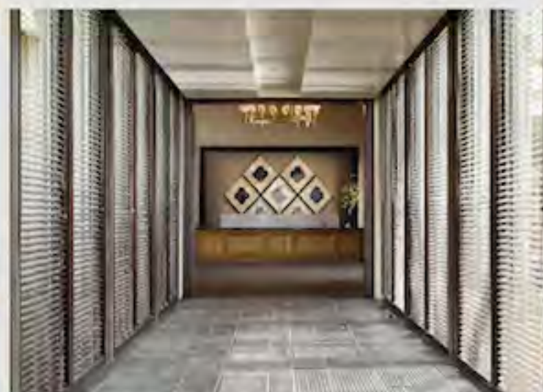
Rosewood Sand Hill California, USA