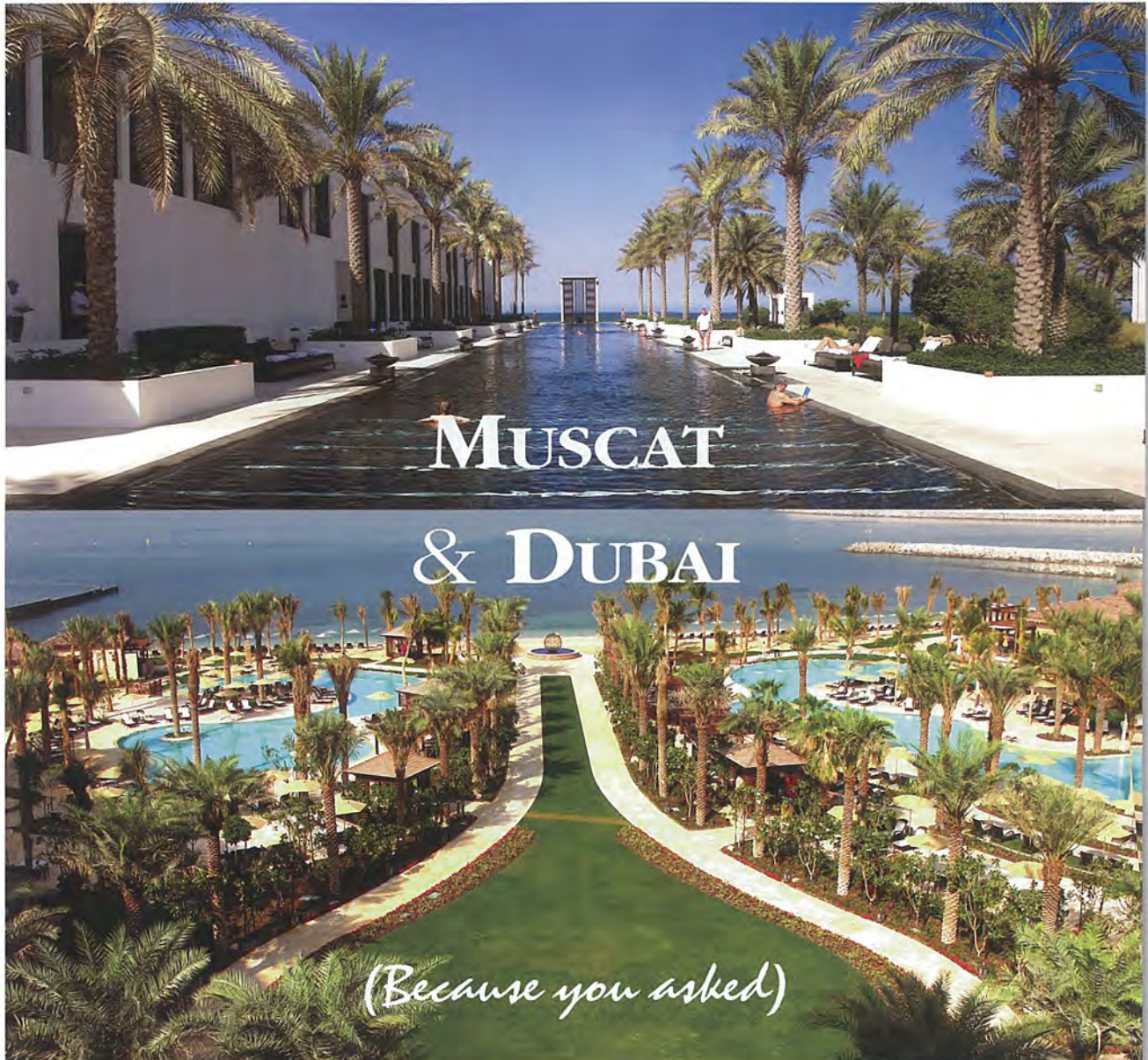
Top: The Long Pool at The Chedi Muscat. Bottom: View of the edge-of-ocean pools at the just-opened Four Seasons Resort Dubai.

SETTING THE BENCHMARK FOR HIGH-END TRAVELLERS