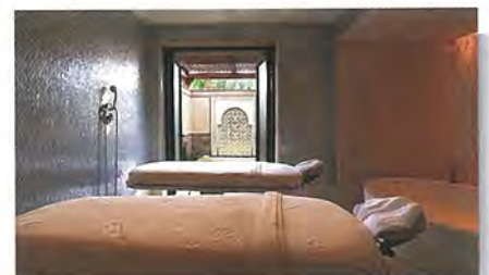
A Spa Suite at Four Seasons Resort Dubai.

restarted in 2010, the original designers were gone, so corners were cut and, yes, this really shows. The Bar, for instance,