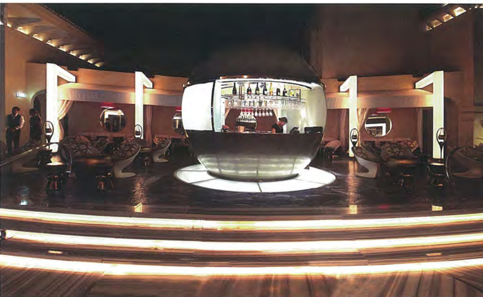
At Four Seasons Resort Dubai, the sensational Mercury Lounge and one of the private tower-set majlis.

tains frankincense and rose. Not surprisingly, we had an excellent massage.