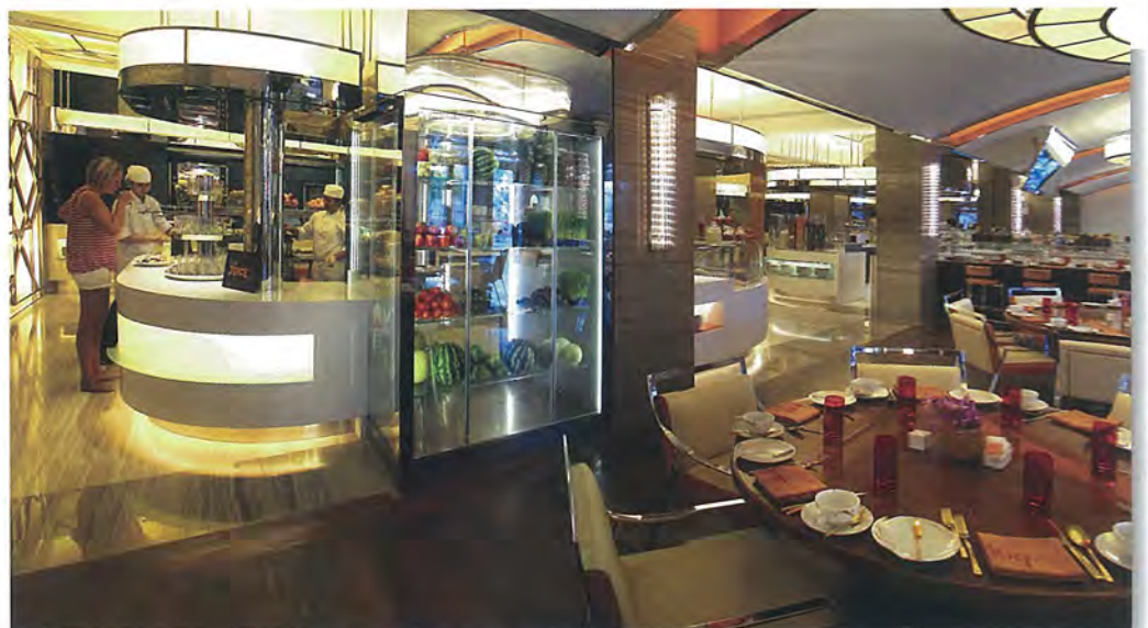
The Juice Bar, on the left, at Suq, Four Seasons Dubai's all-day dining restaurant.