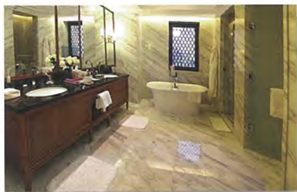
Big airy bathrooms, at Four Seasons Resort Dubai.

sensitively designed to enhance the treatments. Expect the usual GHM mix of spa products, including chemical-free.