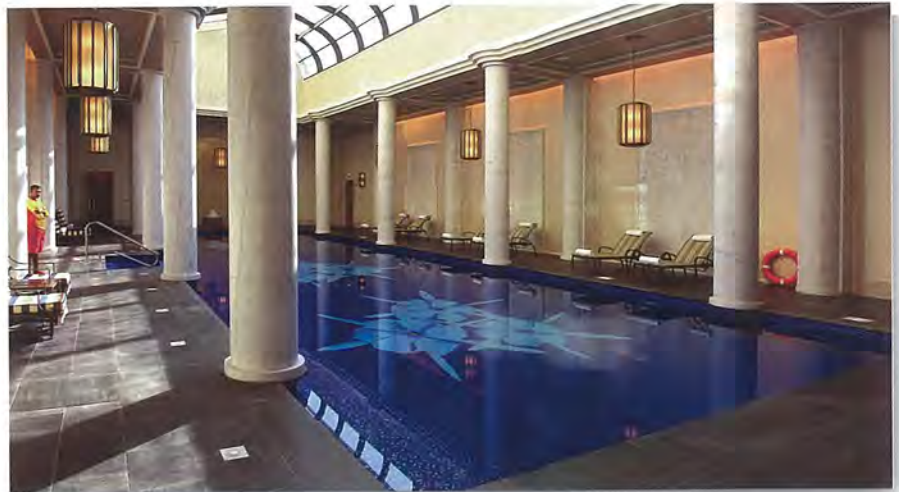
The indoor pool is bathed in light, at Four Seasons Resort Dubai.

Every room has an off-corridor lobby, with two rooms on either side. This not only cuts down corridor noise, but it also