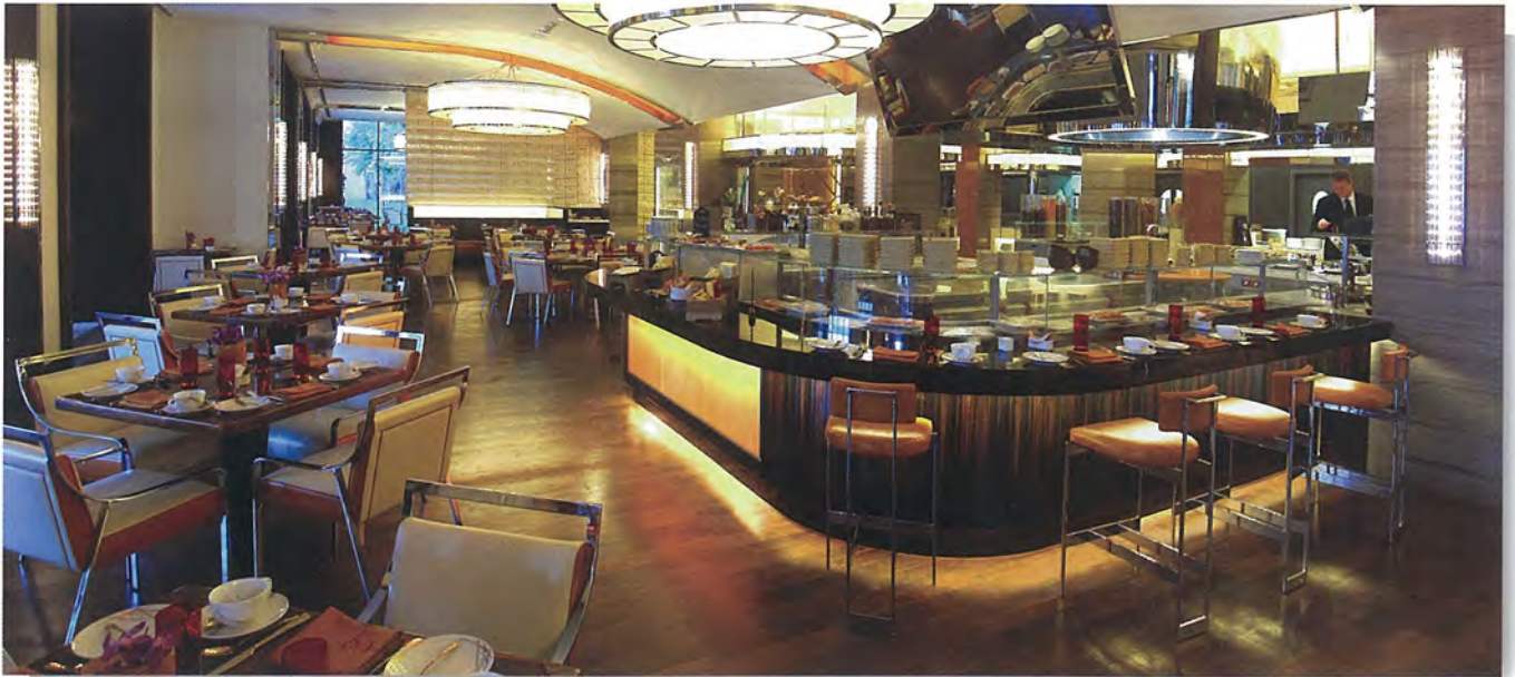
Redefining the buffet at Suq; Four Seasons Dubai's all-day dining concept.

sees their spa offerings worldwide, so I was not surprised to find a very good Spa