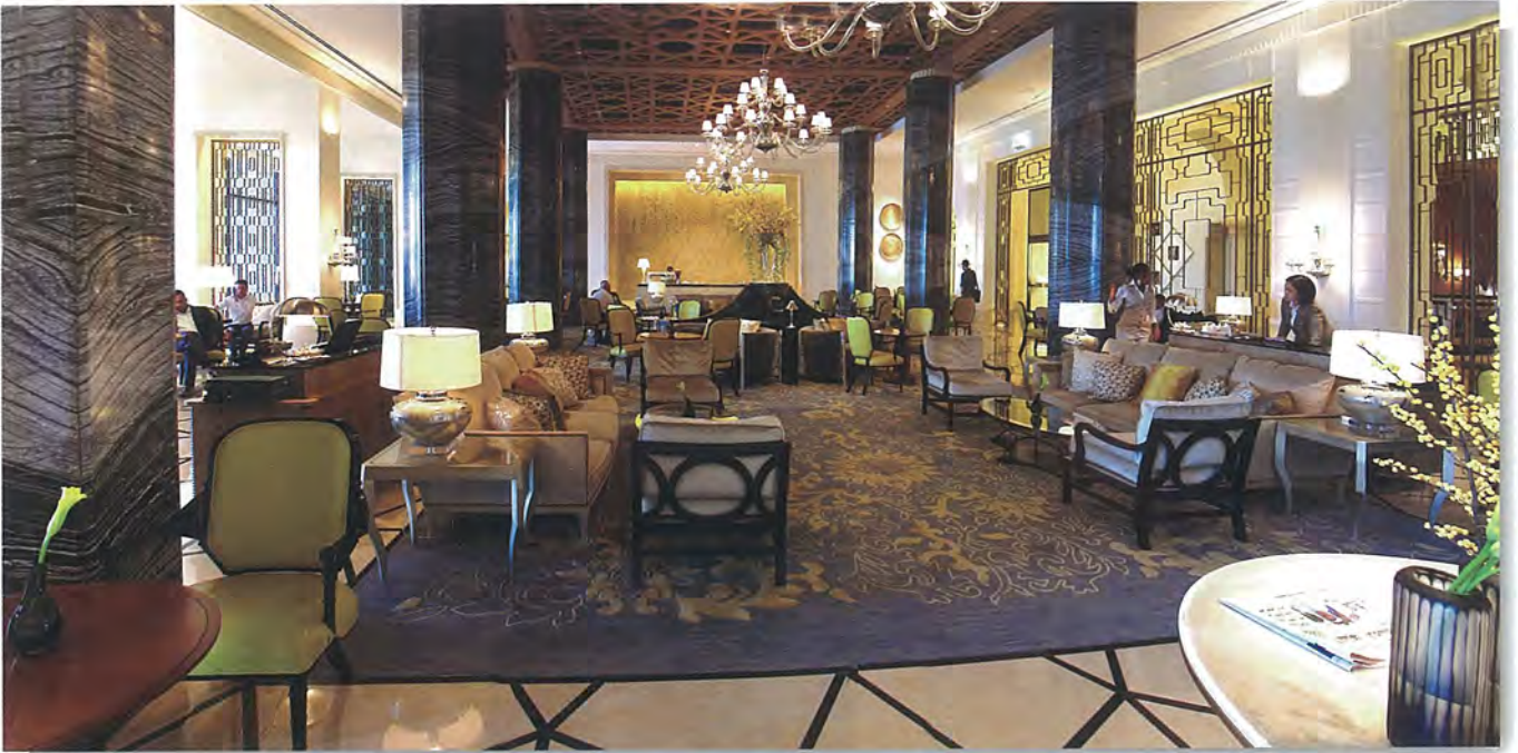
The stunningly designed Shai Salon, at Four Seasons Resort Dubai.

Downstairs, meanwhile, whimsical cocktails, Champagnes and wines combine with caviar-centric snacks that set the tone. Even though I am well past my use-by-date when it comes to clubbing, I could not resist this