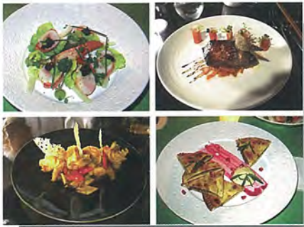
Fine Four Seasons fare in Dubai.

Downstairs, meanwhile, whimsical cocktails, Champagnes and wines combine with caviar-centric snacks that set the tone. Even though I am well past my use-by-date when it comes to clubbing, I could not resist this