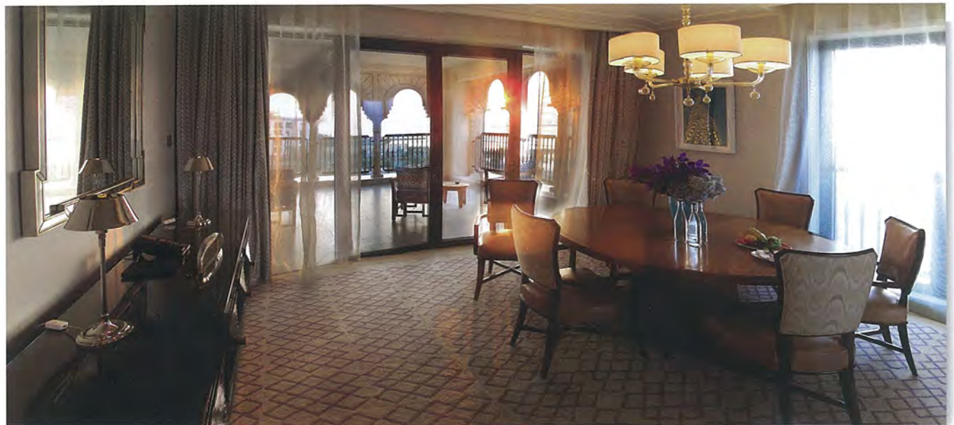
A corner of the sitting and dining room in Imperial Suite, #402, at Four Seasons Resort Dubai, which opens onto a large covered terrace.

There are all sorts of lovely things to experience here, but the real twist is the sensational 6th floor rooftop Mercury Lounge, with its three private 1,001 nights style majlis; one in its own fairytale tower that takes in Dubai's iconic landmarks.