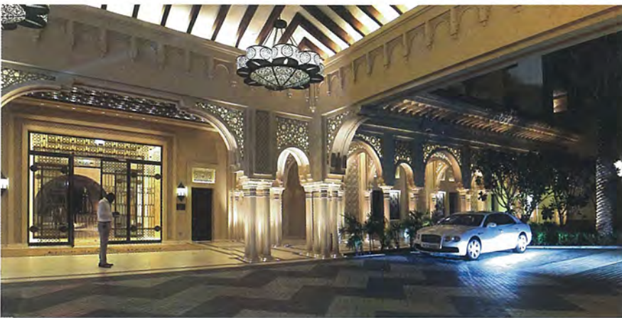
The sumptuous porte cochère at Four Seasons Resort Dubai, with one of its cream Bentleys.

The Presidential Suite, #502, also with one to three bedrooms (and the opportunity to connect with more) is a beautiful, coolly elegant space, with polished plaster