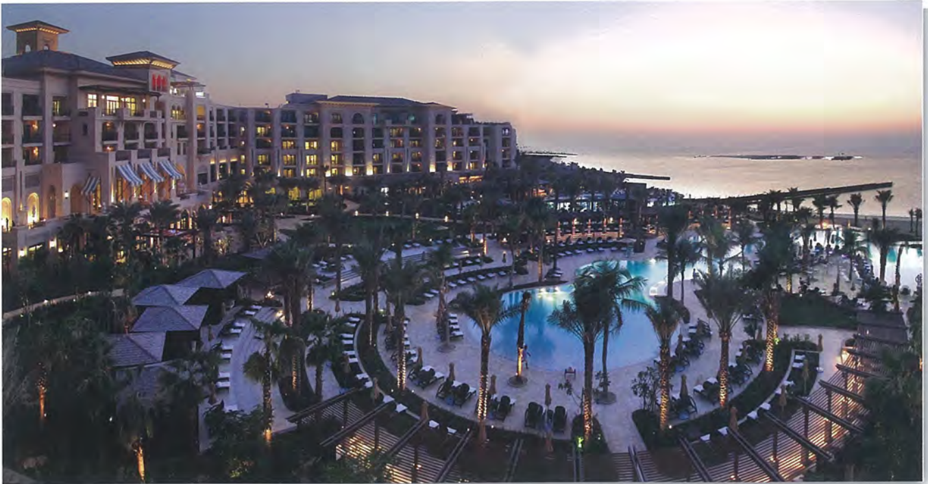
Even in its infancy, the new Grande Dame of Dubai, Four Seasons Resort Dubai, takes everything else out of the water.