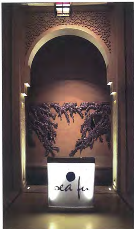
Entrance to Sea Fu restaurant, at Four Seasons.

Although The Oberoi is very much a business hotel, it does offer a leafy outdoor infinity pool, which helps you ignore the towering glass and steel that surrounds it. There is also a lovely internal courtyard off Nine7One; the hotel's International all-day dining venue, which is an unfortunate hodge-podge of design elements. Personally, I prefer the modern Asian restaurant, Umai, which is smaller, more intimate and better designed; the dim sum excellent. I