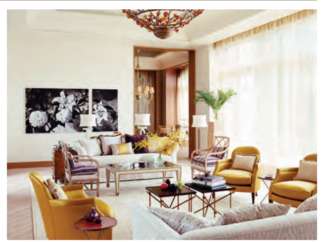
Hong Kong Residence