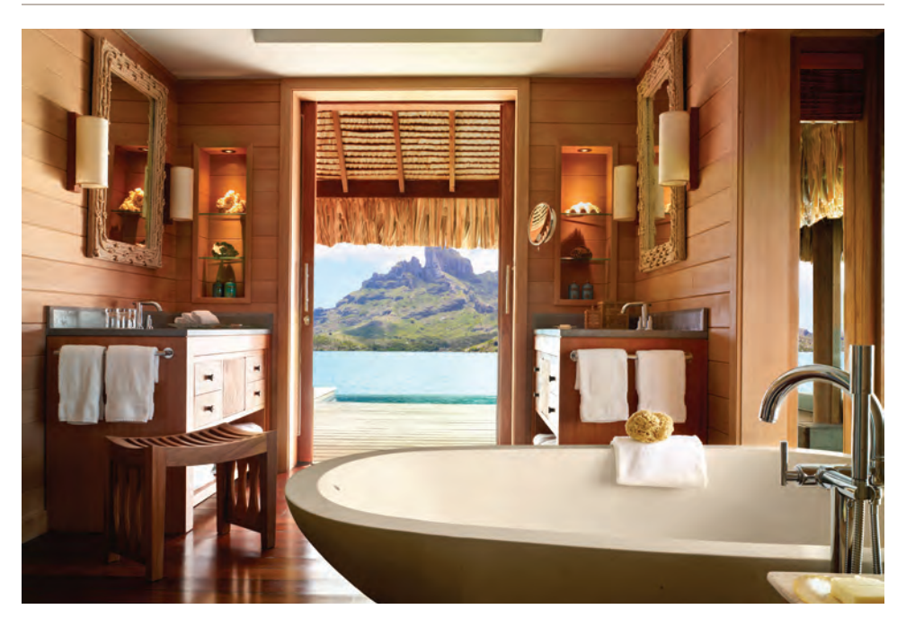
Four Seasons Bora Bora