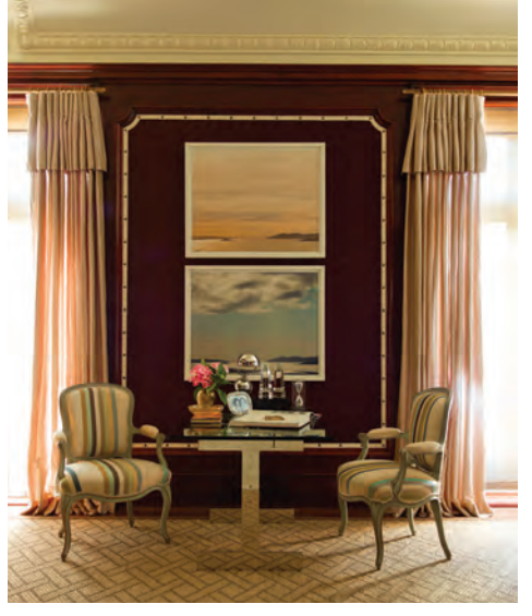
San Francisco Salon