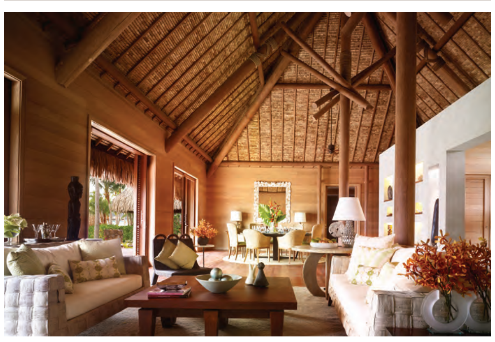
Four Seasons Bora Bora