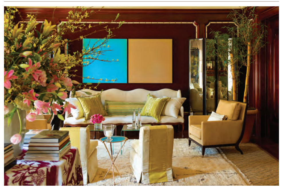
San Francisco Salon